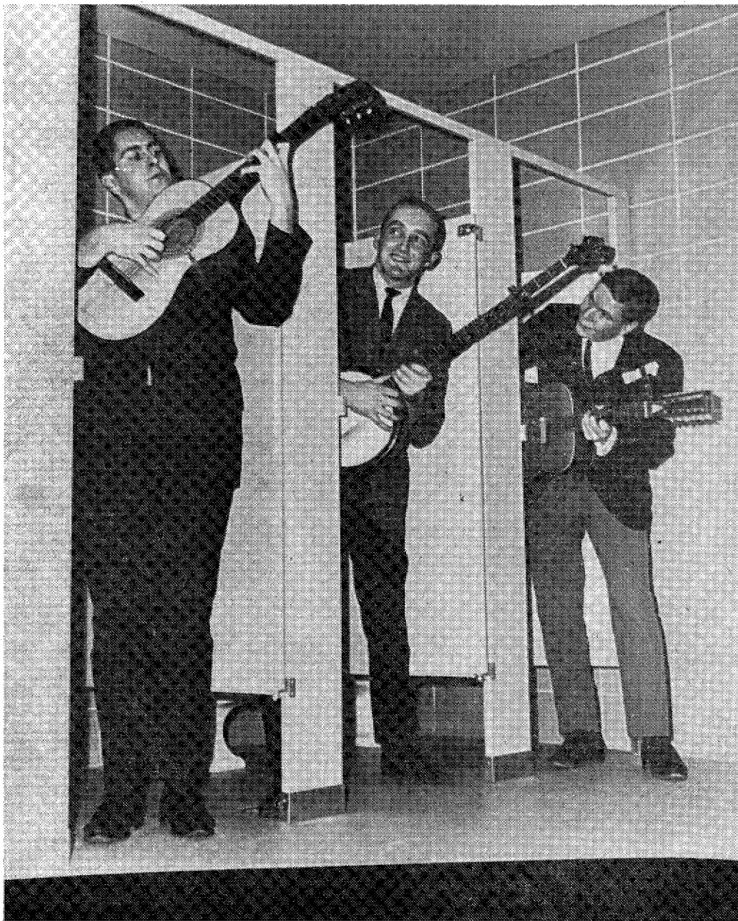
Group Rehearsing Before Show